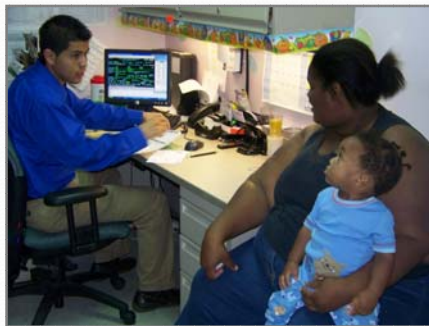
North Miami Beach WIC, Miami, FL